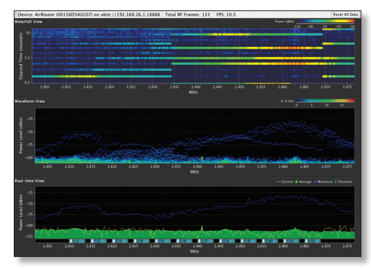
AirView Tool provides real-time wireless signal statistics

AirOS Management Interface offers configuration and management options from the convenience of a web browser