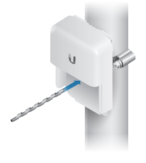
2. Drill a pilot hole into the pole.